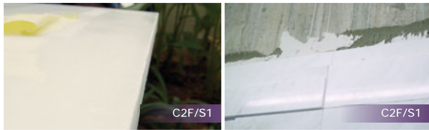
Fig. 5.2 – Porous natural stones with a substrate of cement render or concrete.

High performance fast-setting with early tensile strength and deformable adhesive is compatible for installation of stones which are prone to moisture ingress and requires rapid drying. Because of its improved bonding strength and fast setting properties, it is also suitable for floors which are subject to heavy traffic and places that require rapid re-flooring or retrofitting such as supermarkets, hospitals, airports, etc. The use of epoxy material (R type adhesive) is an alternative choice for moisture sensitive tiles or stones. However the cost of epoxy based adhesive is often higher than cementitious adhesives.