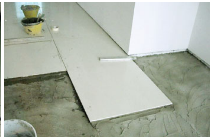
Fig. 5.7 – 1-component adhesive: Add powder + clean potable water.