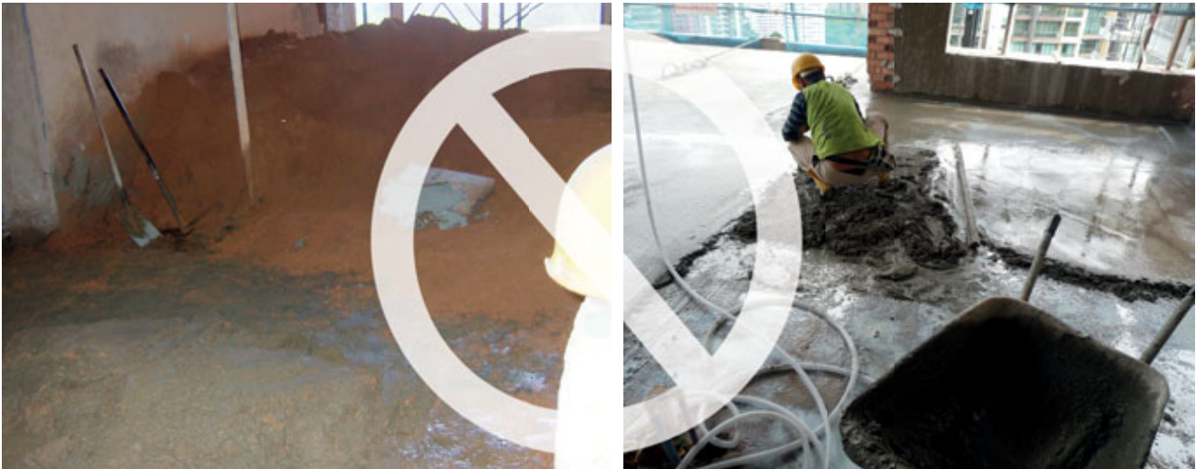
Fig. 5.9 – A typical conventional floor screeding process using cement-sand mortar.

The conventional cement-sand floor screed comprises a layer of mortar of Portland cement and concreting sand which is cast in situ on to a concrete slab. The screed thickness can range from 20 to 30 mm and it needs to be cured for a minimum of 14 days before laying of tiles. Failure to observe this requirement can lead to cracks or debonding of tiles due to inadequate surface preparation.