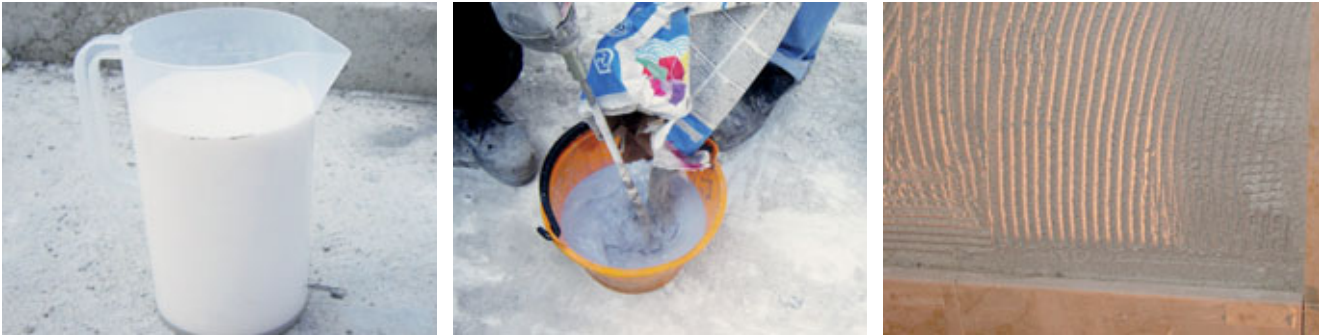
Fig. 5.8 – 2-component adhesive: Add powder + latex liquid.

2-component adhesives consist of a mixture of cement-based powder mortar (component A) and separate latex liquid (component B). They are appropriate for tiles and stones which are prone to moisture ingress and back staining hence requiring a rapid setting adhesive. They are also more suitable for special applications like water features and swimming pools. However both systems also can have the additional properties of fast setting and deformability.