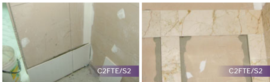
Fig. 5.3 – Installation of tiles and stones on partition board substrate.

The downward movement on a vertical surface is generally high in deformable substrates such as plywood or board partitions. These substrates require the adhesive to be fast setting, deformable and slip resistant for better performance.