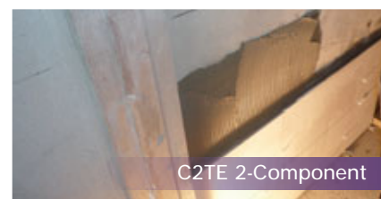
Fig. 5.4 – High water absorbent tiles with a substrate of cement render.

High performance fast setting with early tensile strength 2-component adhesive is compatible for ceramic tiles with high water absorption. The addition of latex liquid instead of water prevents possible back staining on tiles.